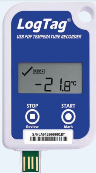
Rated Absolute Accuracy